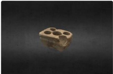
Stone Inkwell Hunt Museum, as part of the Art of Reading in the Middle Ages