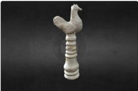
Cockerel signifying St Peter-Staff-head