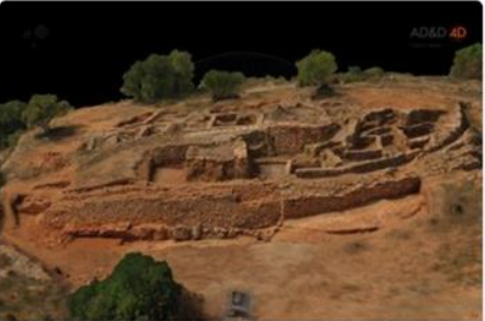
Torrelló Del Boverot | Almassora | Spain