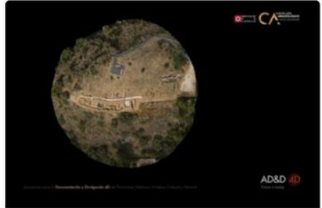
Sant Josep / Vall d'Uixo /Castellón /Spain